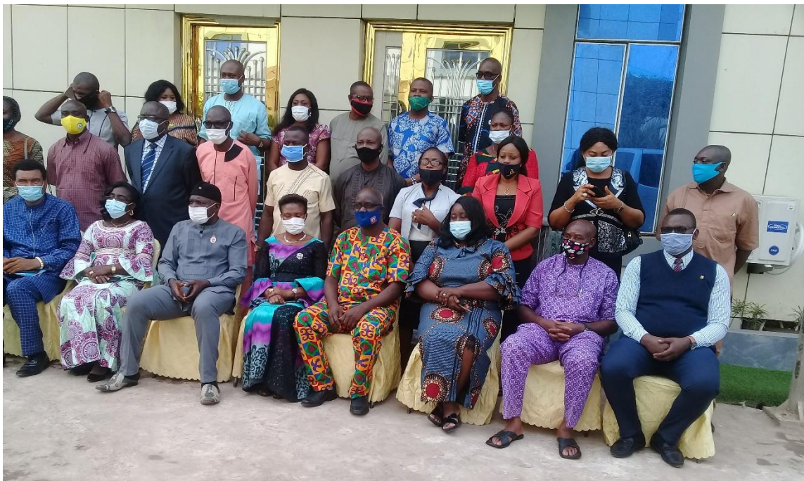
A CROSS SECTION OF PARTICIPANTS DURING THE AUDIT FORUM