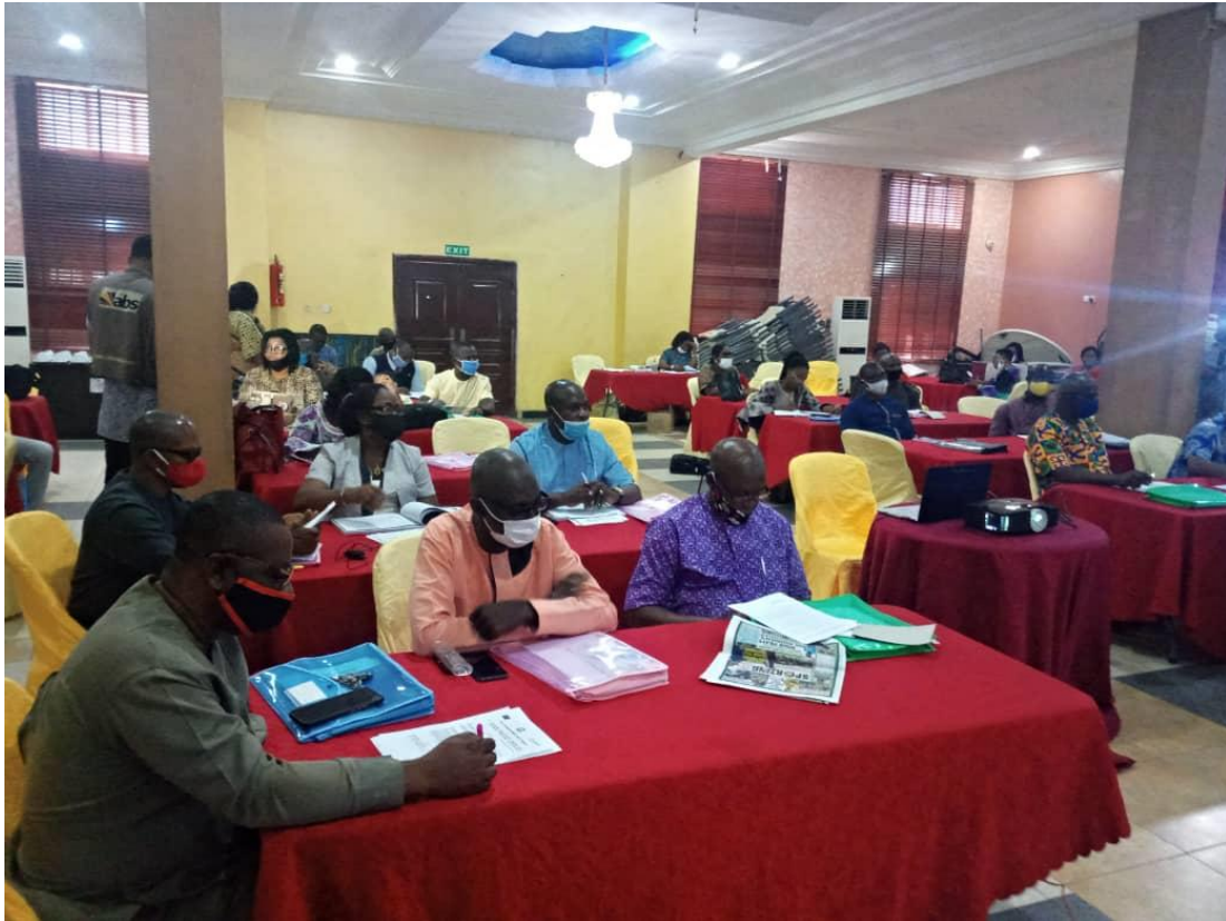
PARTICIPANTS DURING THE AUDIT FORUM